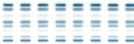
Merck Millipore TLC plates deliver highly reproducible sharp bands over the whole plate as demonstrated by the parallel separation of a lipophilic dye mixture on a silica gel 60 classical TLC plate