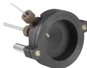
Part No. N0780546