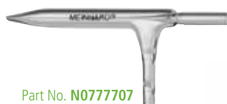
Part No. N077707