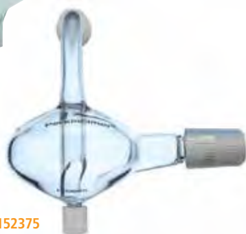
Part No. N8152375