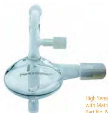
High Sensitivity Spray Chamber with Matrix Gas Port Part No. N8152389