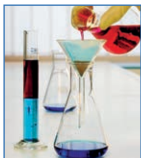
1PS phase separator

In addition to the filtration consumable range, we provide a comprehensive range of accessories for routine work in your laboratory. The table below shows a selection of the products we offer.