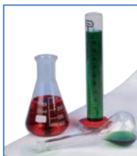
Benchkote™ protection paper