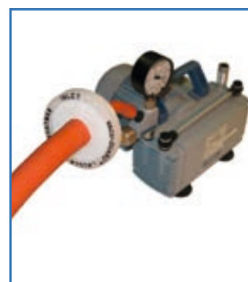
Vacu-Guard Pump protection filter