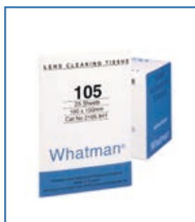
Grade 105 lens cleaning tissue